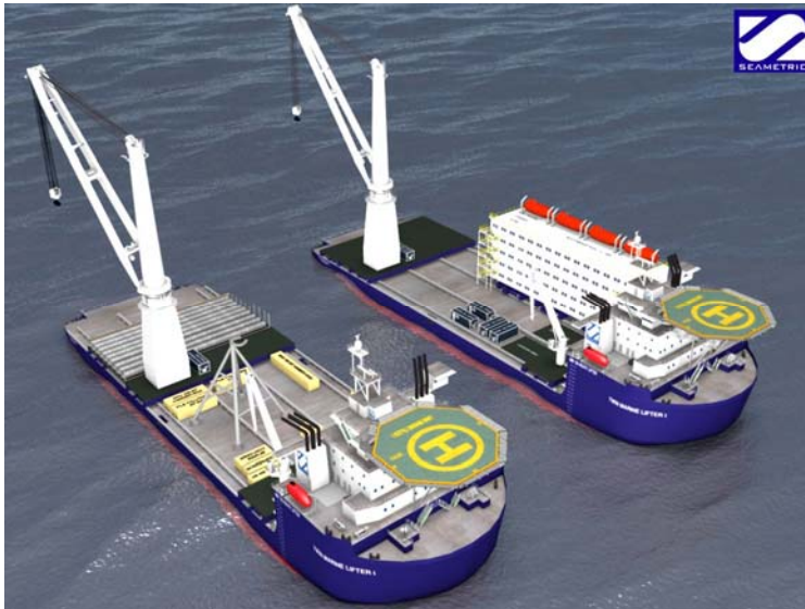
Graphic impression of Sea Metric's Twin Marine Lifter (TML) system