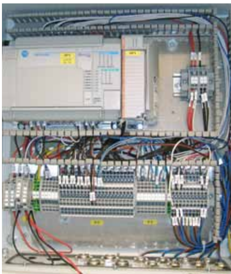
Allen-Bradley MicroLogix 1500